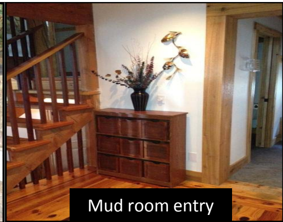
Mud room entry