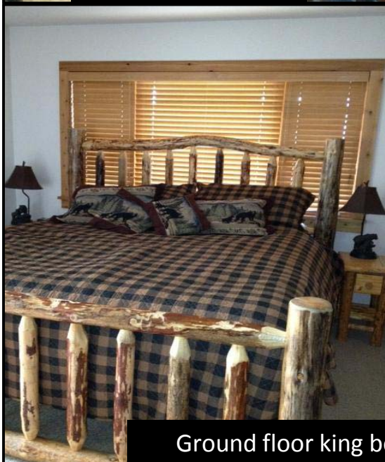
Ground floor king bedroom and bathroom