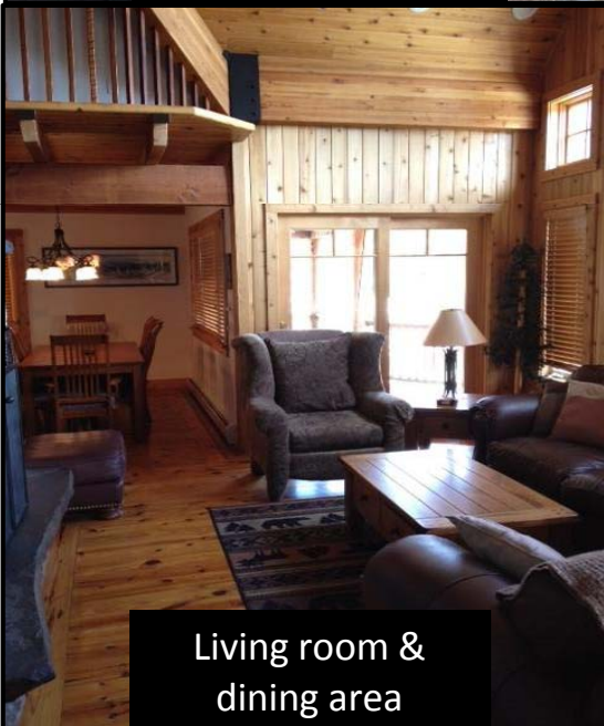
Living room & dining area