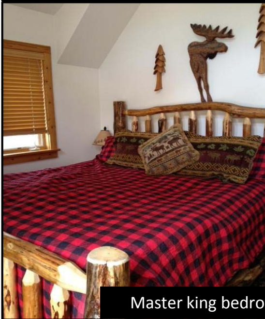
Master king bedroom and full bathroom