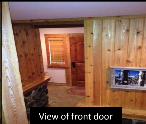
View of front door