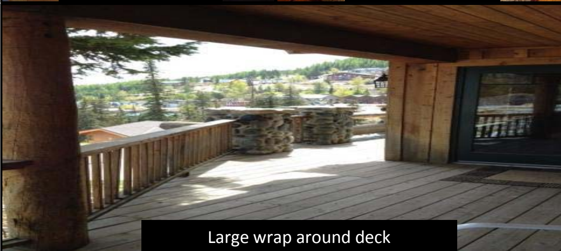
Large wrap around deck