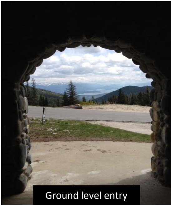
Ground level entry