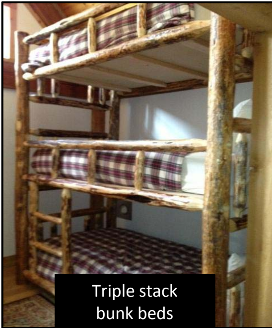
Triple stack bunk beds